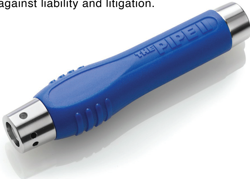
The PIPE, our super-rugged data recorder for cell checks and suicide watches.

Administrators and supervisors can confirm that required checks are being made. If an incident does occur, proper documentation provides protection against liability and litigation.