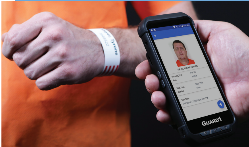
Mobile RFID scanning with SuperMAX device.