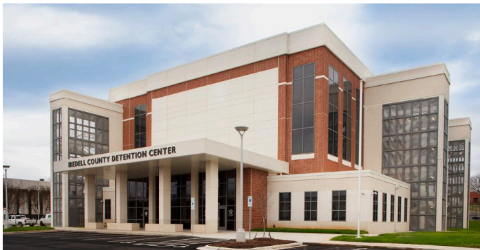
Iredell County Detention Center in North Carolina.