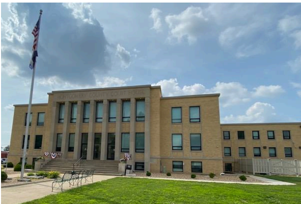
Montgomery County Sheriff's Office